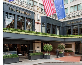
The Westbury Dublin, Ireland