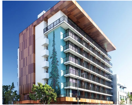
Nobu Hotel Epiphany Palo Alto, California