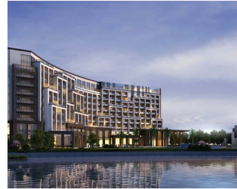
The Anandi Shanghai Shanghai, China