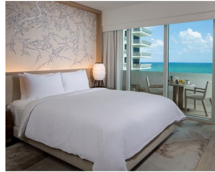
Nobu Miami Miami Beach, Florida