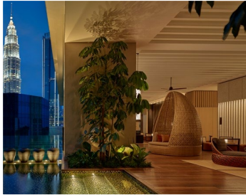
The RuMa Hotel and Residences Kuala Lumpur, Malaysia