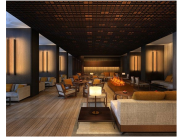
The PuXuan Hotel & Spa Beijing, China Q3 2018