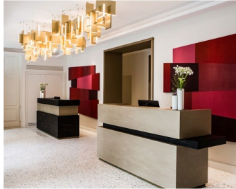
Fauchon L' Hotel Paris, France