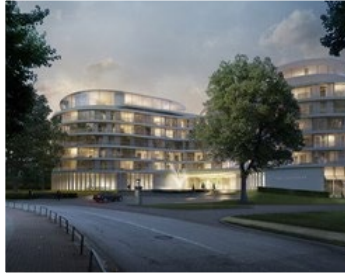
The Fontenay Hamburg Hamburg, Germany