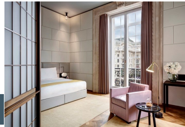
Café Royal London, England