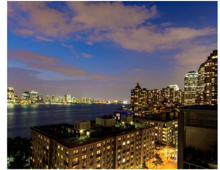
The Wagner at the Battery New York, New York