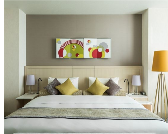
The Imperial Hotel Tokyo, Japan