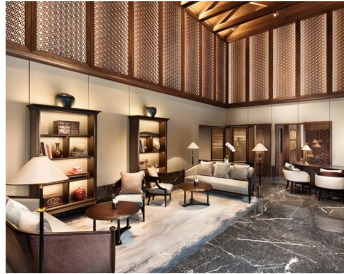
Capella Shanghai, Jian Ye Li Shanghai, China