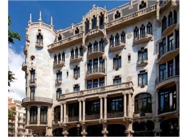
Casa Fuster Barcelona, Spain