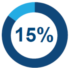
of trips serviced by independently-owned franchise locations