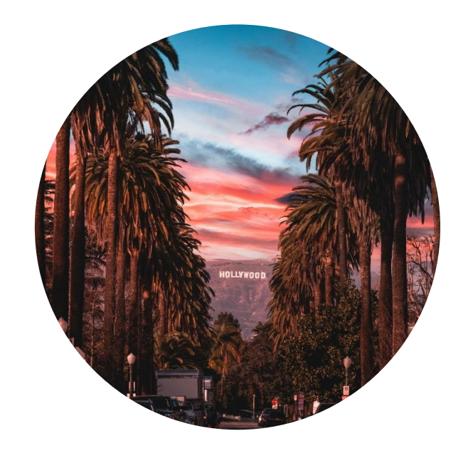
Los Ángeles (LAX)