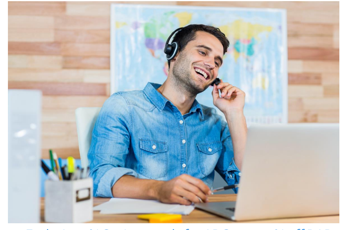
Exclusive 2% Savings - only for ABC rates. 2% off BAR