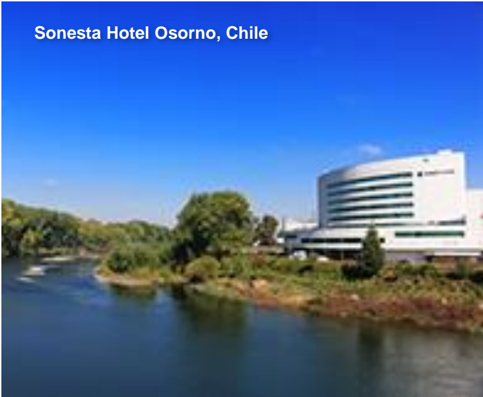
Sonesta Hotel Osorno, Chile

PERU Sonesta Lima El Olivar Sonesta Posadas Yucay Sonesta Hotel Arequipa Sonesta Posadas Del Inca-Puno Sonesta Cusco