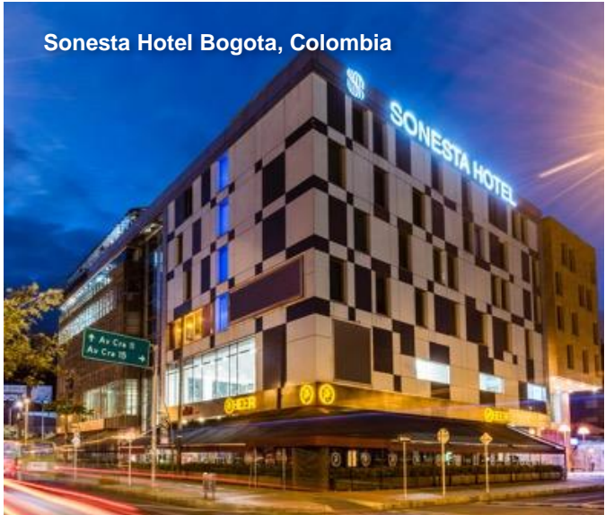
Sonesta Hotel Bogota, Colombia