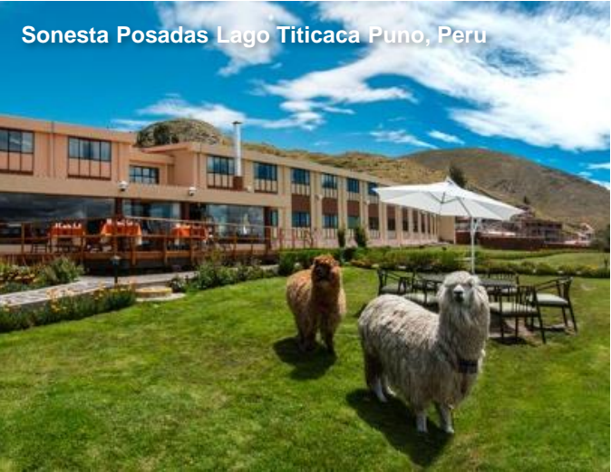
Sonesta Posadas Lago Titicaca Puno, Peru