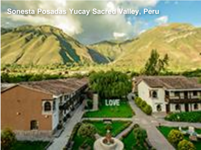
Sonesta Posadas Yucay Sacred Valley, Peru