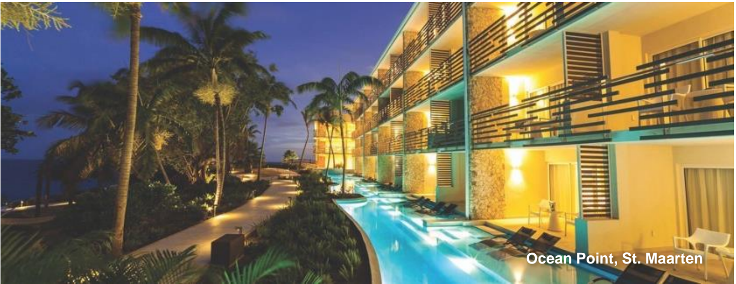
Ocean Point, St. Maarten