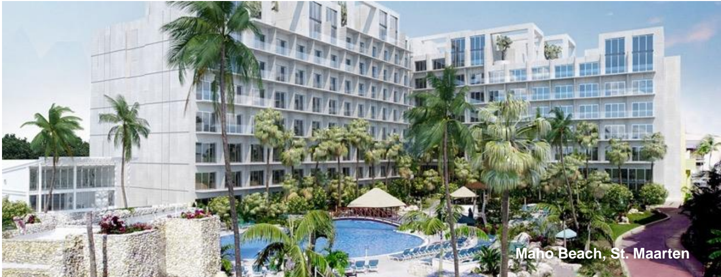
Maho Beach, St. Maarten